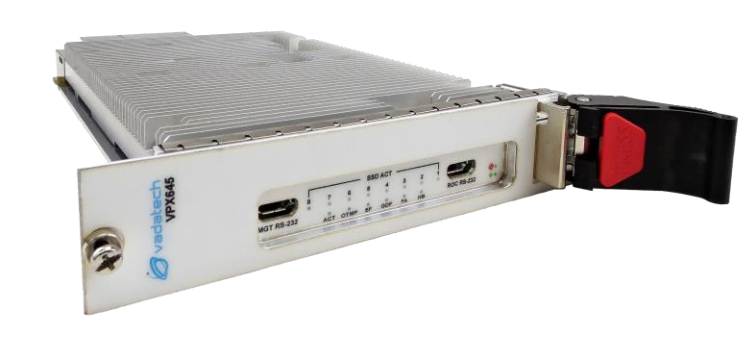
Figure 1: VPX645

The Unit is available in both air-cooled and rugged conduction-cooled versions. Please contact sales for details.