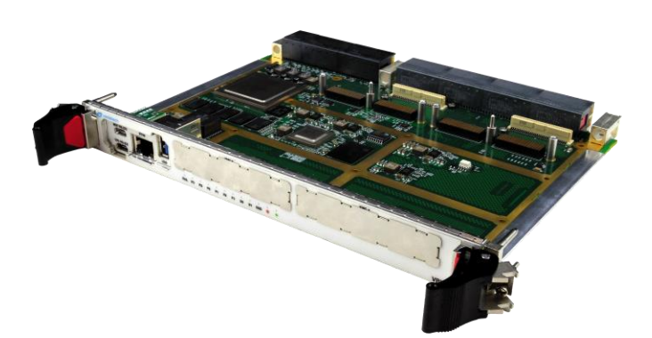
Figure 2: VPX706 without Heatsink