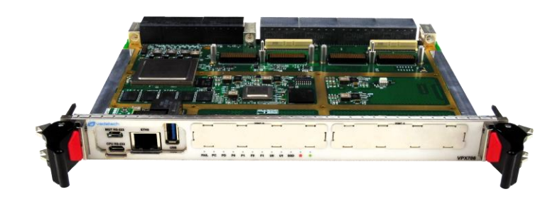
Figure 3: VPX706 without Heatsink Front View