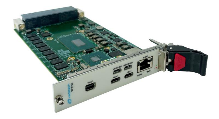
Figure 1: VPX760

The unit is available in a range of temperature and shock/vib specifications per ANSI/VITA 47, up to V3 and OS2.