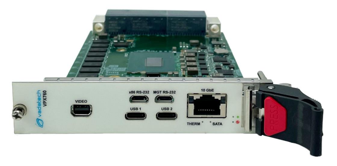
Figure 3: VPX760 Front Panel