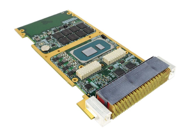
Figure 2: VPX765 Rear View