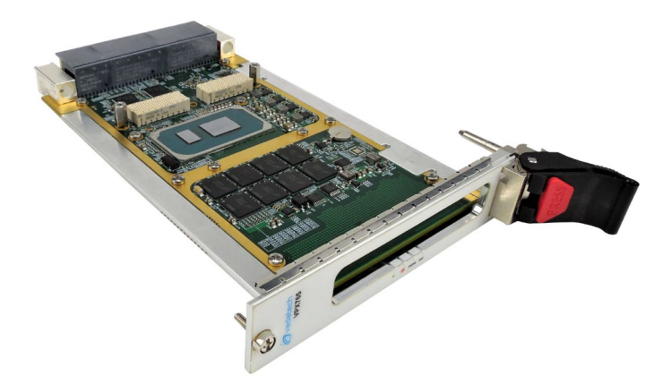
Figure 1: VPX765 Front View

The unit is available in a range of temperature and shock/vib specifications per ANSI/VITA 47, up to V3 and OS2.