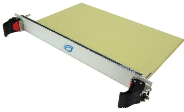
Figure 1: VPX999

The VPX999 is a filler panel for use with single or double module slots to prevent air flow through empty slots in the chassis.