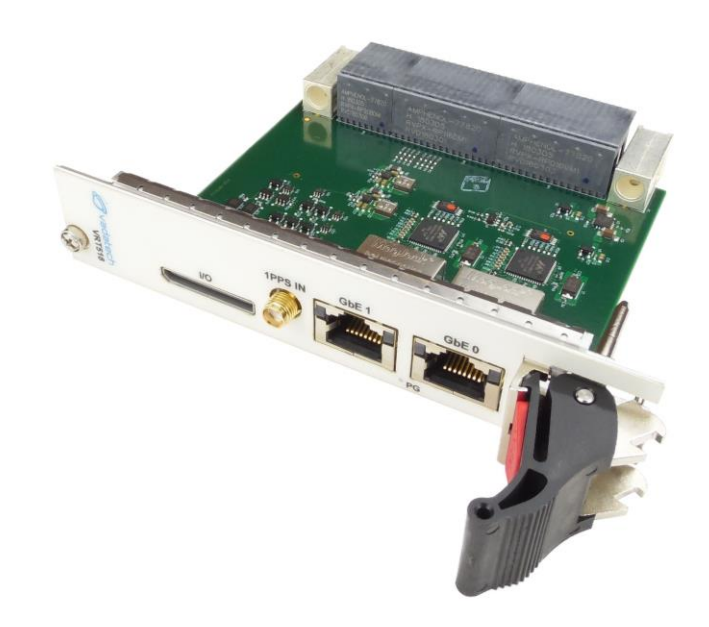
Figure 1: VRT518A

The high speed I/O connector supports general purpose and serial interfaces routed from RP2 LVDS. This section of the board can be customized for specific customer requirements, contact VadaTech sales for details.