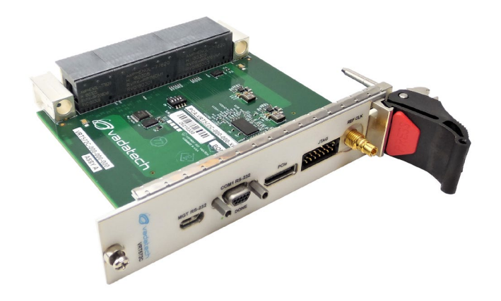
Figure 1: VRT572C

The module has a PCle expansion via 4x OCuLink.