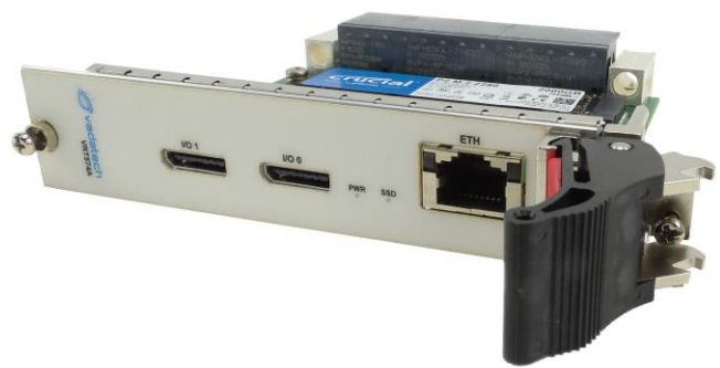
Figure 1: VRT574A

Two OcuLink high speed I/O connectors support general purpose and serial interfaces routed from RP1, one for LVDS lanes [0:7] and one for M-LVDS lanes [8:15]. This section of the board can be customized for specific customer requirements, contact VadaTech sales for details.