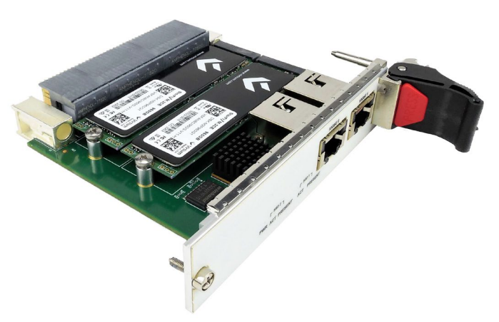
Figure 1: VRT761A

VRT761A has dual M.2 SATA Socket as well as Dual 10GbE Copper ports.