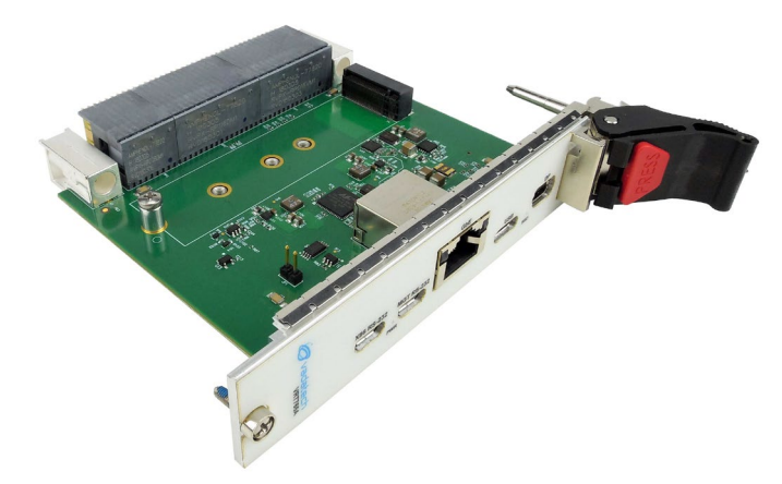
Figure 1: VRT765A

VRT765A routes DP, USB3.2, GbE, PCIe x4 to M.2 NVME and Dual RS-232 for easy access of the I/O.