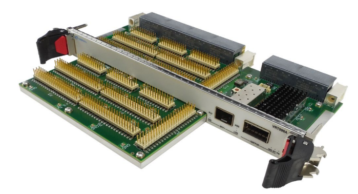
Figure 1: VRT990A

P3 thru P6 are routed to 0.1" headers for easy access.