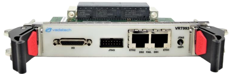
Figure 2: VRT993 Front Panel View