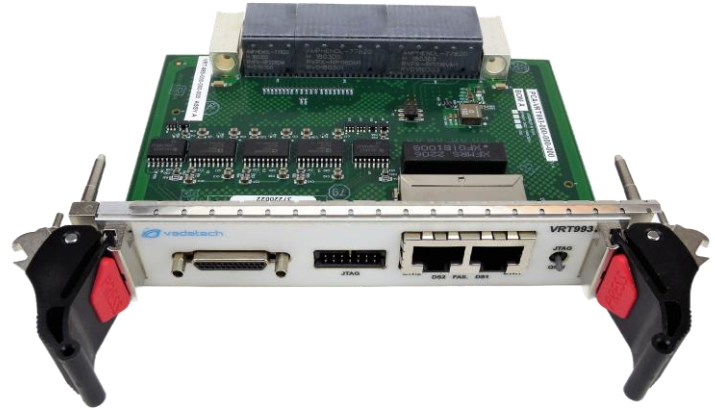
Figure 1: VRT993

The VRT993 has a custom width which does not follow the VITA-46 specification. The Module VS1 and VS3 are connected to +5V which does not follow the VITA-46 RP0 recommended Power Connection.