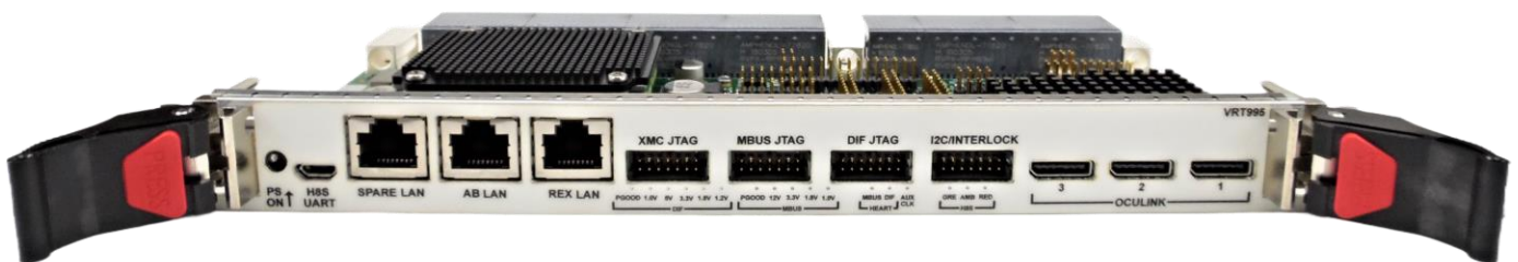
Figure 2: VRT995 Front Panel View