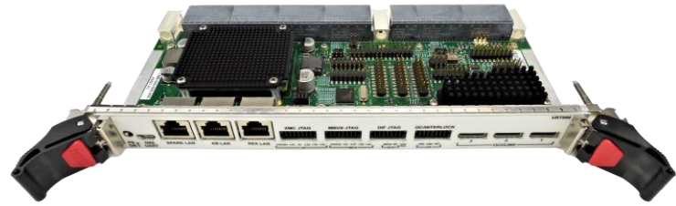
Figure 1: VRT995

The VRT995 routes I/O from the front module to the RTM. The module takes power from P6 and generates +28V for the front module as well as power the P0 for the front module.