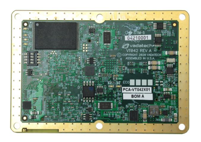
Figure 2: VT042 Overhead View