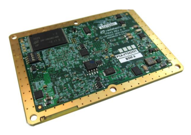
Figure 1: VT042