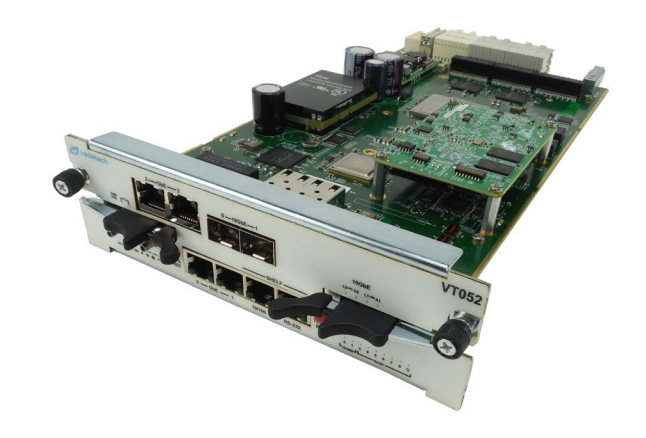
Figure 1: VT052

The VT052 is fully hot-swappable to minimize service downtime.