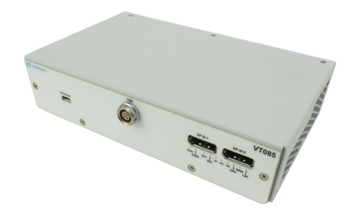
Figure 1: VT085

The VT085 is orderable with a fanless enclosure or optionally as a board-level product without enclosure. This allows customers to fully integrate the unit into their own user console.