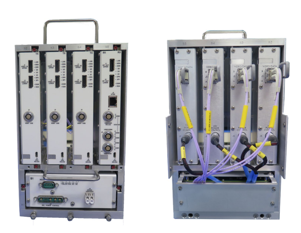
Figure 3: Conduction cool deployment example