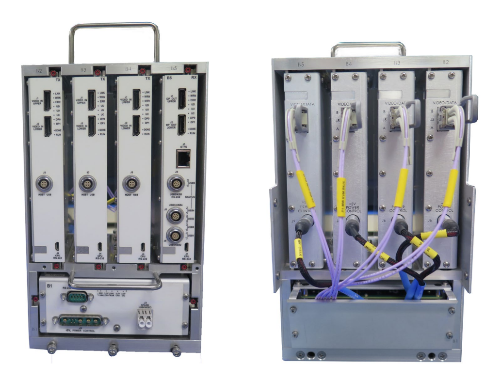
Figure 3: Conduction cool deployment example