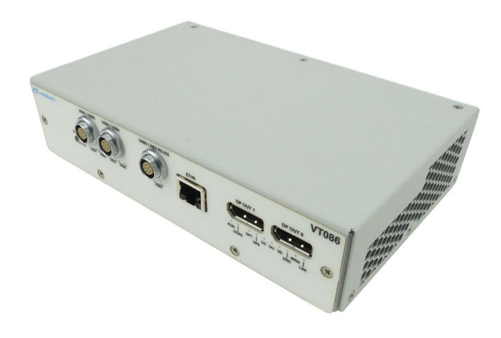
Figure 1: VT086

The VT086 is orderable with a fanless enclosure or optionally as a board-level product without enclosure. This allows customers to fully integrate the unit into their own user compute/server environment.