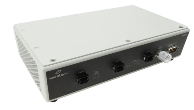
Figure 1: VT218 Front View

The VT218 has internal fans that cool the system. The fan speed is adjustable via a front panel knob.