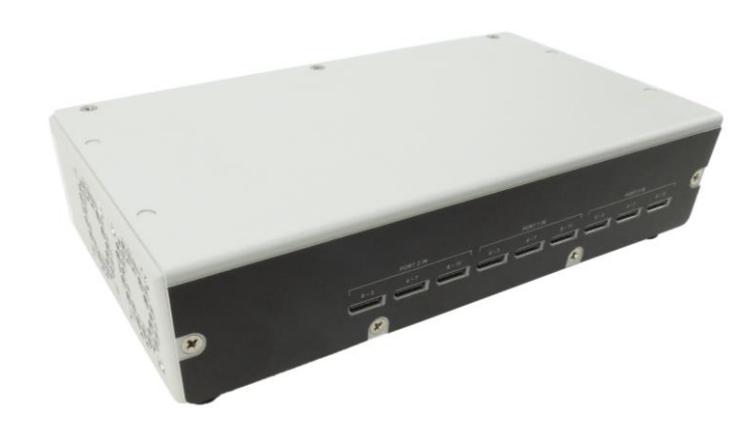
Figure 2: VT218 Rear View