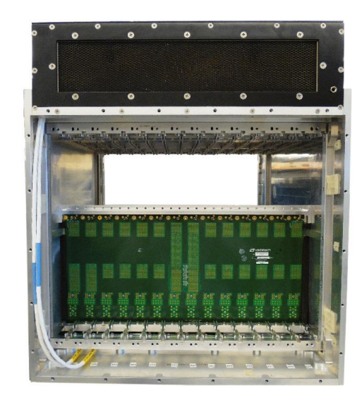
Figure 2: Rear View