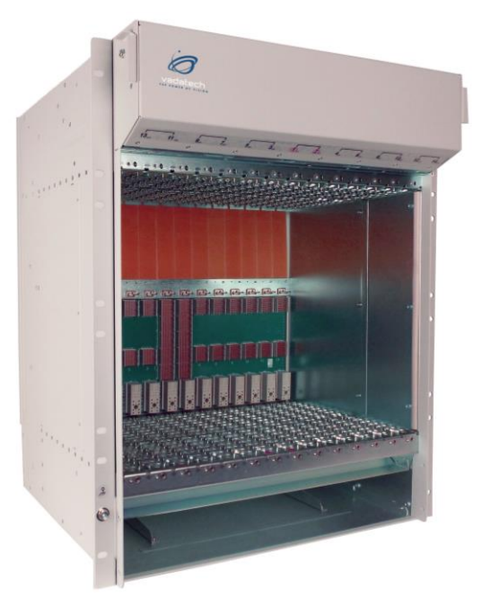
Figure 1: VT825