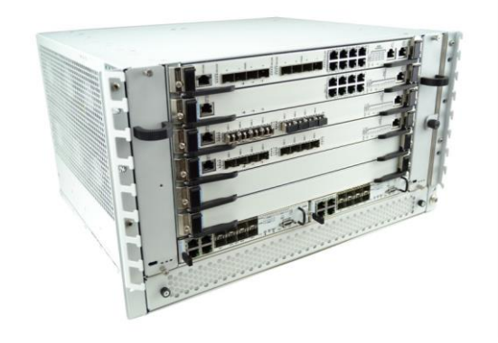
Figure 1: VT830

VadaTech's Scorpionware software can be used to access information about the current state of the Shelf or the Carrier, obtain information such as the FRU population, or monitor alarms, power management, current sensor values, and the overall health of the Shelf. The software GUI is very powerful, providing a Virtual Carrier and FRU construct for a simple, effective interface.