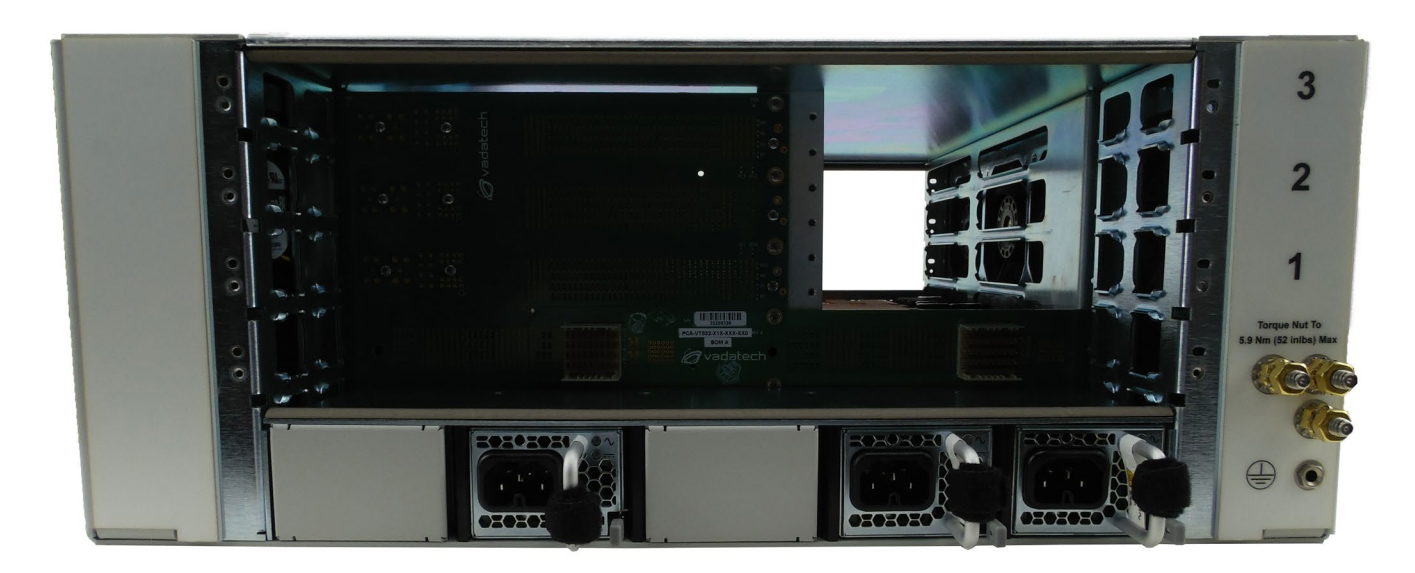
Figure 3: VT832 Rear View