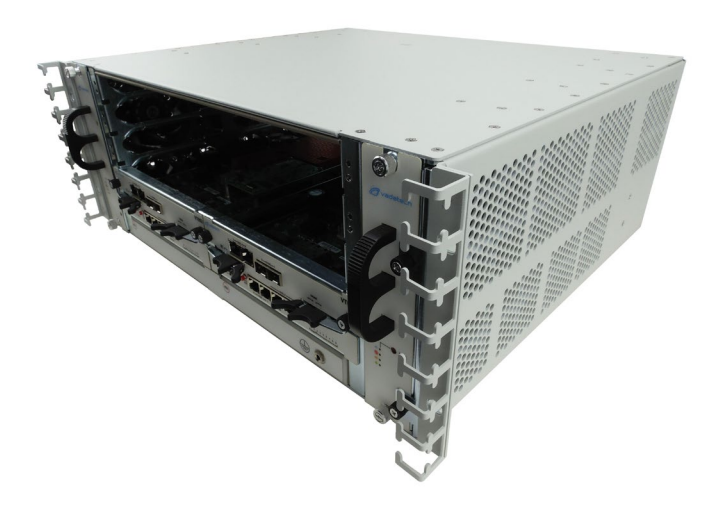
Figure 1: VT832

VadaTech's Scorpionware software can be used to access information about the current state of the Shelf or the Carrier, obtain information such as the FRU population, or monitor alarms, power management, current sensor values, and the overall health of the Shelf. The software GUI is very powerful, providing a Virtual Carrier and FRU construct for a simple, effective interface.