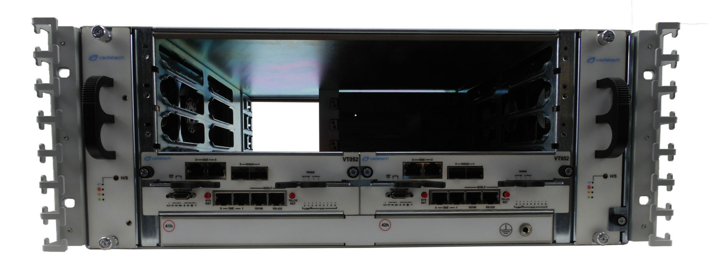
Figure 2: VT832 Front View