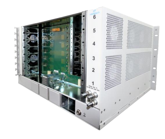
Figure 4: VT837 Rear View 2