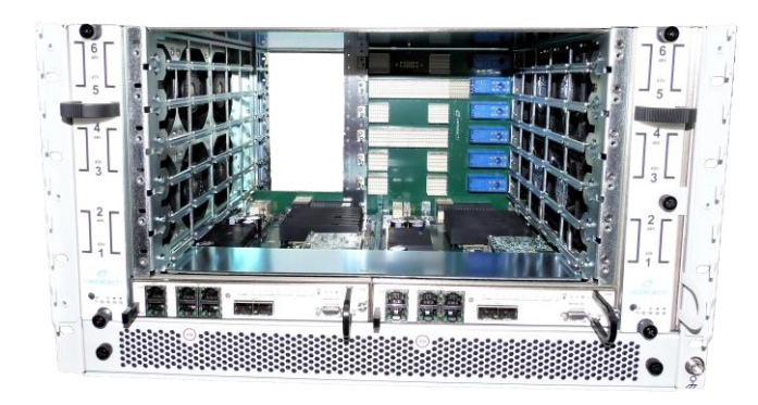
Figure 1: VT837

VadaTech's Scorpionware software can be used to access information about the current state of the Shelf or the Carrier, obtain information such as the FRU population, or monitor alarms, power management, current sensor values, and the overall health of the Shelf. The software GUI is very powerful, providing a Virtual Carrier and FRU construct for a simple, effective interface.