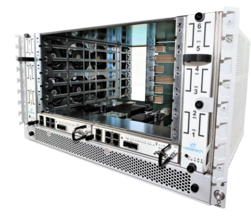
Figure 2: VT837 Front View 2