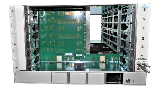
Figure 3: VT837 Rear View