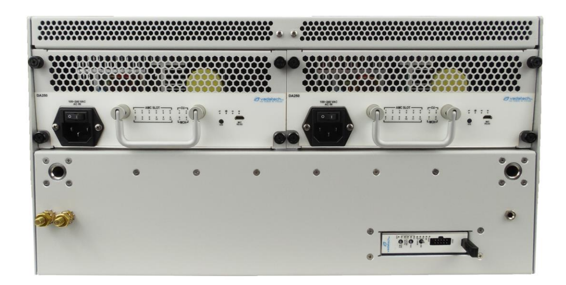
Figure 4: VT867 Rear View