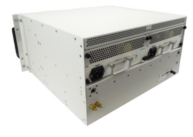
Figure 2: VT867 Rear View