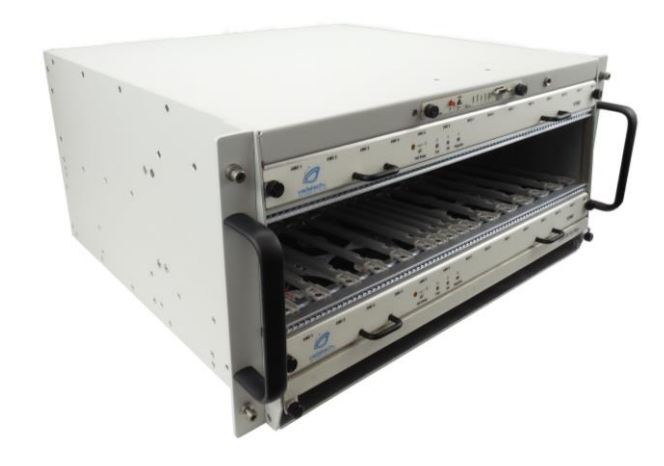
Figure 1: VT867 Front View

VT867 - 5U MTCA Chassis Platform with 12 AMC Slots