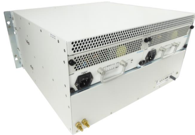
Figure 2: VT868 Rear View