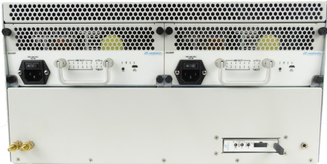
Figure 4: VT868 Rear View