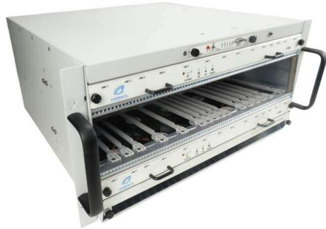
Figure 1: VT868 Front View

The VT868 has dual redundant FRU information and Carrier Locators. The Carrier Locator is assigned by mechanical dip switches which are easily accessible. The MCH reads the Locator via its private I2C bus.