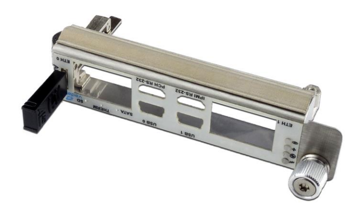
Figure 3: Single Latching Flange Panel (example)

The VadaTech SLF design is a space-saving solution for rugged environments and is compatible with the VT951. It provides one latching flange and screw on the opposite side of the standard AMC latching handle. This front panel solution provides improved retention strength and stability. MicroTCA.1 compliant AMCs have latching flanges on both sides of the board, providing up to 25g shock and 8g random vibration resistance. However, in horizontal-mount enclosures the dual flanges take up considerable space. The SLF design from VadaTech reduces the space utilized, allowing more performance density to be offered in specially-designed enclosures. The SLF solution's screw spacing is compatible with MicroTCA.1. Therefore, this design can be utilized in all of VadaTech's standard 3U to 5U horizontal-mount chassis that accept both MicroTCA.0 and MicroTCA.1 panels.