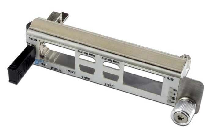
Figure 4: Single Latching Flange Panel (example)

The VadaTech SLF design is a space-saving solution for rugged environments and is compatible with the VT955. It provides one latching flange and screw on the opposite side of the standard AMC latching handle. This front panel solution provides improved retention strength and stability. MicroTCA.1 compliant AMCs have latching flanges on both sides of the board, providing up to 25g shock and 8g random vibration resistance. However, in horizontal-mount enclosures the dual flanges take up considerable space. The SLF design from VadaTech reduces the space utilized, allowing more performance density to be offered in specially-designed enclosures. The SLF solution's screw spacing is compatible with MicroTCA.1 Therefore, this design can be utilized in all of VadaTech's standard 3U to 5U horizontal-mount chassis that accept both MicroTCA.0 and MicroTCA.1 panels.