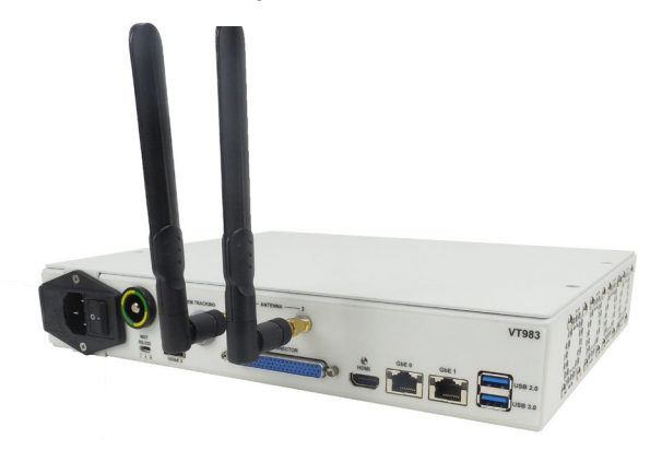
Figure 2: VT983 with Antenna