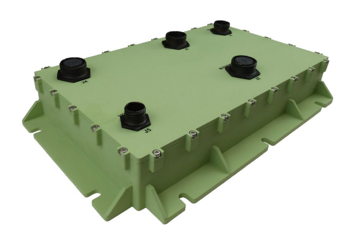
Figure 3: VT986 Conduction Cool Version