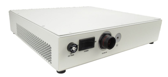
Figure 2: VT986 Rear View