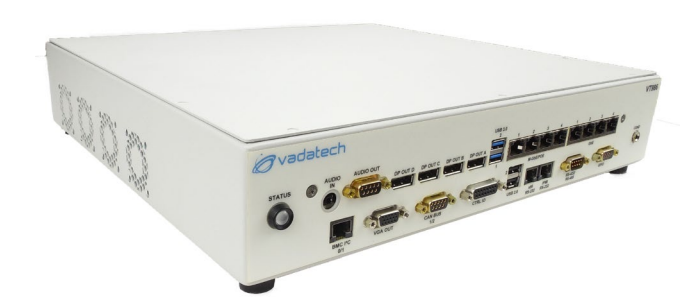
Figure 1: VT986 Front View

Linux OS is standard on the VT986, consult VadaTech for further options.