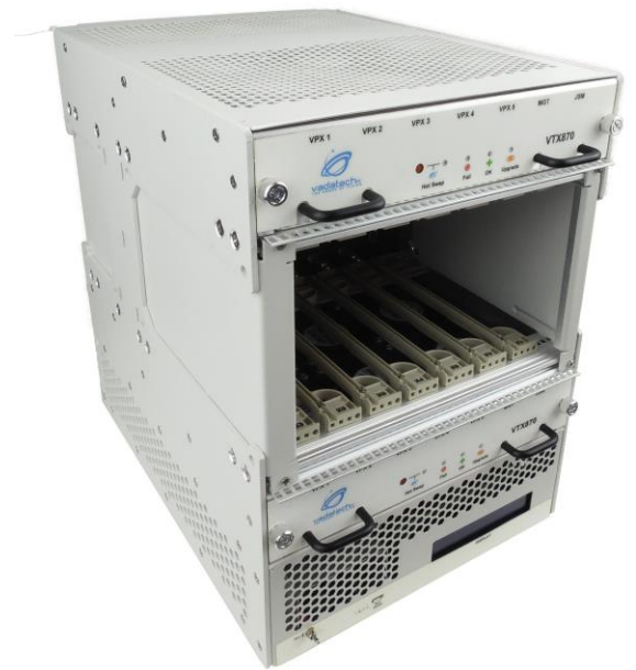
Figure 1: VTX870 Chassis Front View

There is an optional JTAG Switch Module to provide JTAG access to the front.