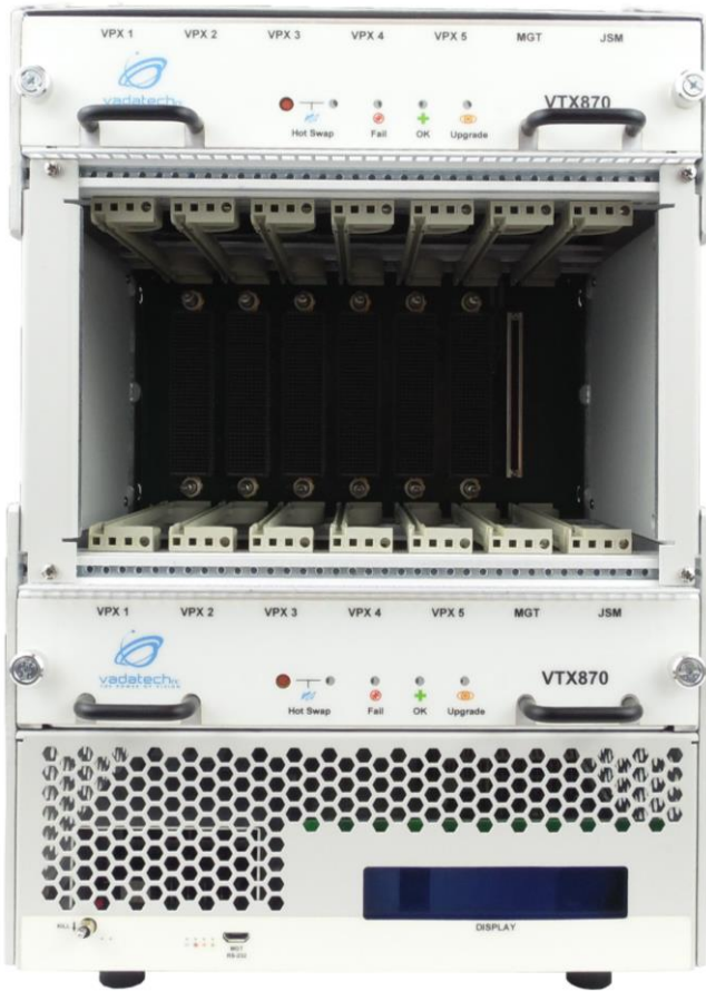
Figure 4: VTX870 Chassis Layout - Front