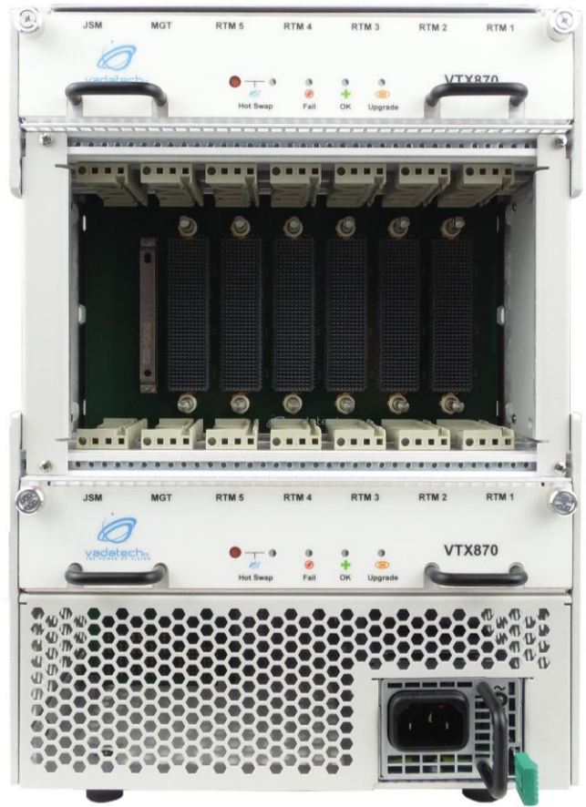
Figure 5: VTX870 Chassis Layout - Rear