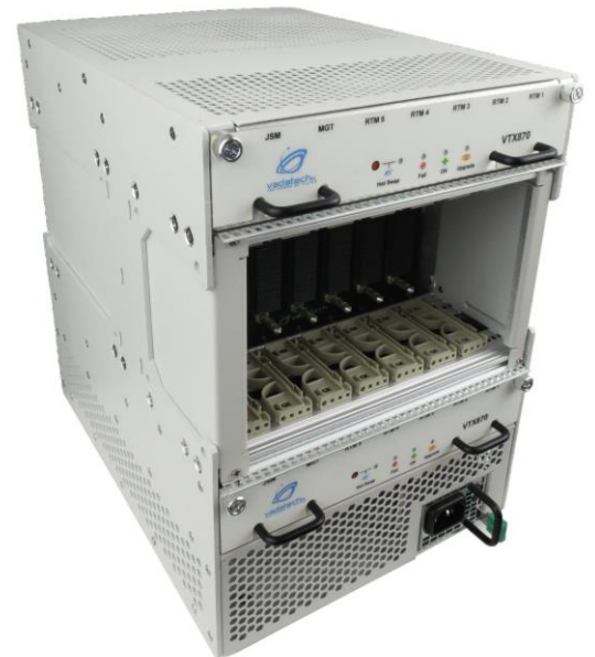
Figure 2: VTX870 Chassis Rear View