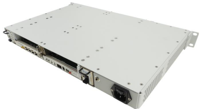
Figure 2: VTX951 Rear View