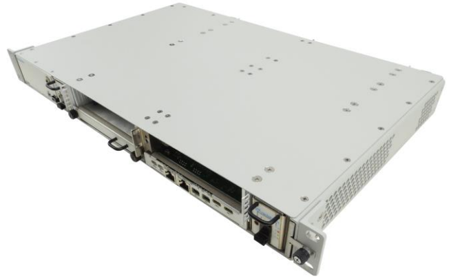
Figure 1: VTX951 Front View

The backplane provides two 3U VPX payload slots in a star configuration, fully compliant to VITA 46.0 baseline specification, with additional support to the RTMs, compliant to VITA 46.10 and OpenVPX VITA 65. VadaTech is open to modify the backplane to meet customer requirements.