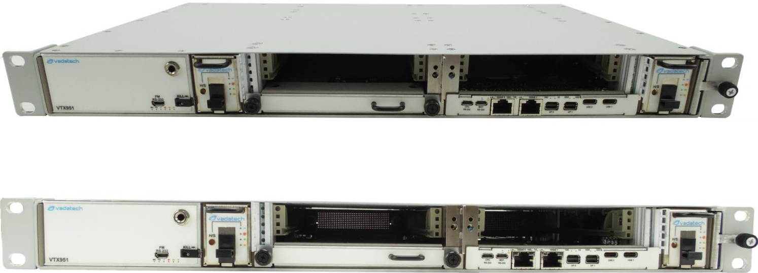
Figure 4: Chassis Layout – Front