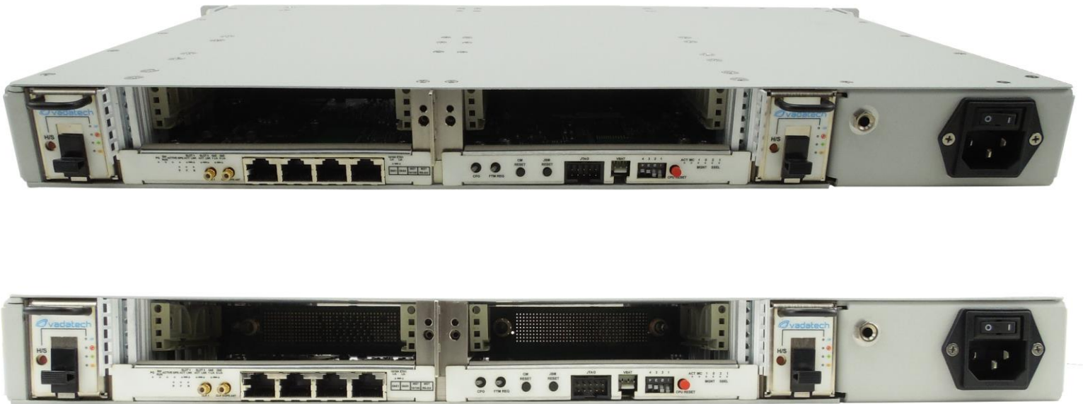
Figure 5: Chassis Layout – Rear