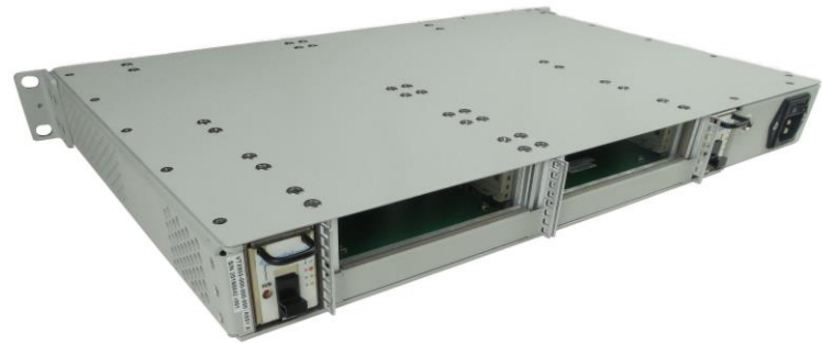
Figure 2: VTX955 Rear View