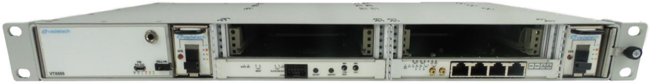
Figure 4: VTX955 Chassis Layout – Front