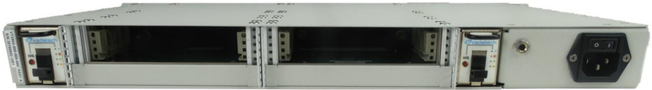
Figure 5: VTX955 Chassis Layout - Rear