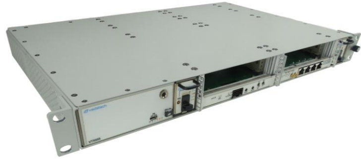
Figure 1: VTX955 Front View

The backplane provides two 3U VPX payload slots in a star configuration, fully compliant to VITA 46.0 baseline specification, with additional support to the RTMs, compliant to VITA 46.10 and OpenVPX VITA 65. VadaTech is open to modify the backplane to meet customer requirements.