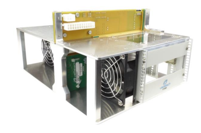
Figure 2: VTX980 Chassis Rear View