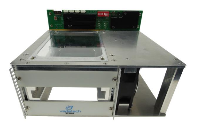
Figure 2: VTX980 Conduction Cooled