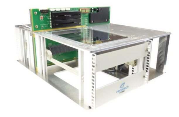
Figure 1: VTX980 Chassis Front View

The backplane breaks-out the JTAG signals via a header connector to enable external connection of a JTAG probe.