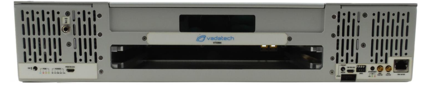
Figure 3: VTX994 Chassis Layout - Front View