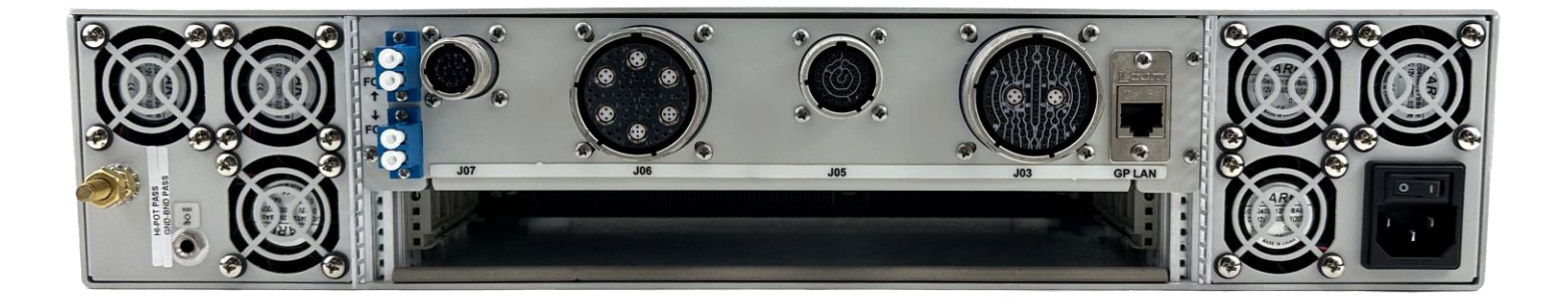
Figure 5: VTX994 Chassis Layout with custom I/O- Rear View