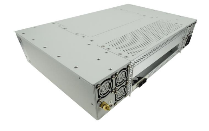
Figure 2: VTX994 Rear View