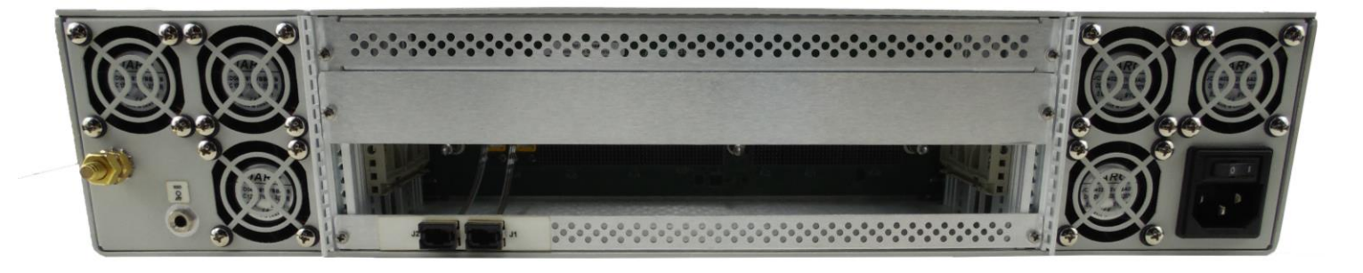
Figure 4: VTX994 Chassis Layout - Rear View

Figure 3: VTX994 Chassis Layout - Front View