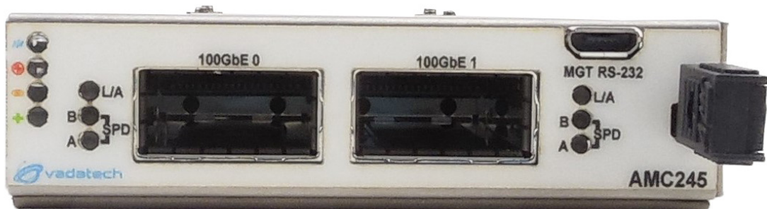
Figure 2: AMC245 Functional Block Diagram