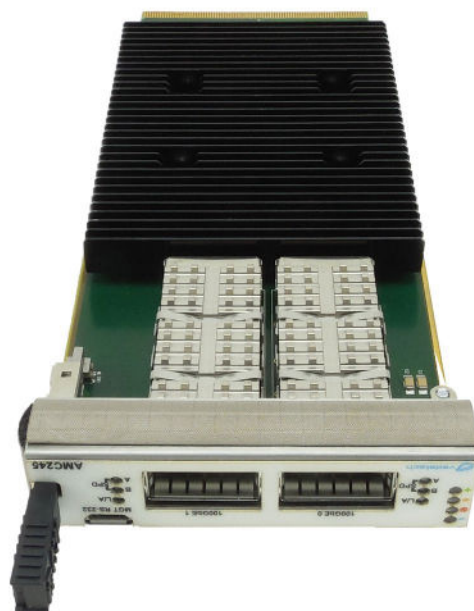
Figure 1: AMC245

The module allows mix of 100G, 50G, 25G and 10G. Please contact VadaTech.