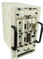
VT899 Cube Chassis