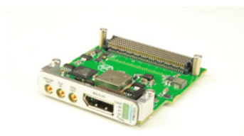
FMC223 High Speed FMC for DAC