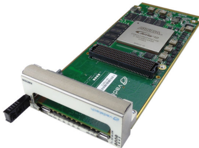
Figure 1: AMC536

See Intel FPGA Solutions for the advantages of using VadaTech products during application development.