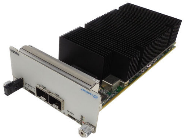
Figure 2: AMC539 w/ Heatsink