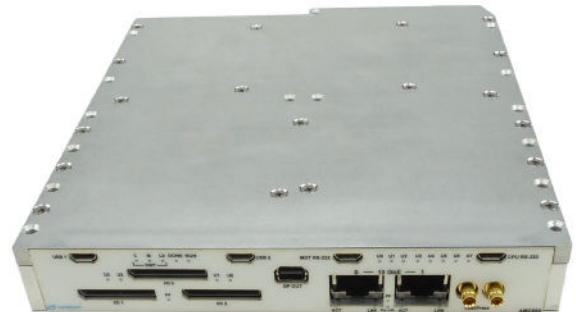
Figure 2: AMC560 Conduction Cool stand alone