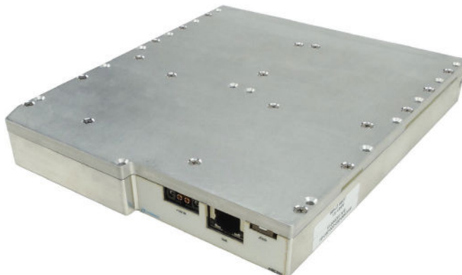
Figure 3: Rear AMC560 Conduction Cool stand alone