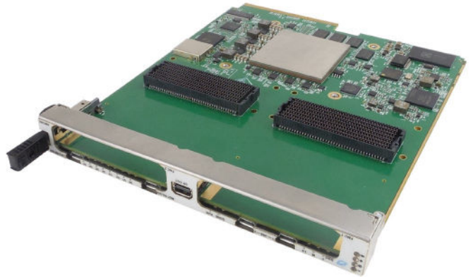
Figure 1: AMC560

The Module has onboard 64 GB of Flash, 128 MB of boot flash and an SD Card as an option.