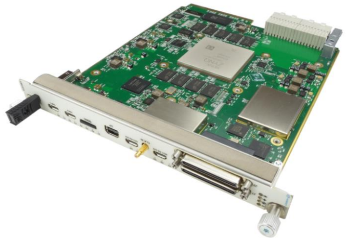
Figure 1: AMC575

The Module has onboard 64 GB of Flash, 128 MB of boot flash and an SD Card as an option.