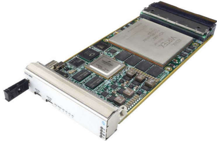
Figure 1: AMC596

The onboard quad core P2040 runs at 1.2 GHz with 1 GB of DDR3, 128 MB of Boot Flash, and a 32 GB SD Card. The PPC has x4 PCIe interface to the FPGA in addition to its local bus. The PPC has its dual GbE routed to Ports 0 and 1 of the AMC via a mux to also allow FPGA routing to the Ports. The same applies to Ports 2-3 (PPC SATA Ports or directly to the FPGA via mux selection).