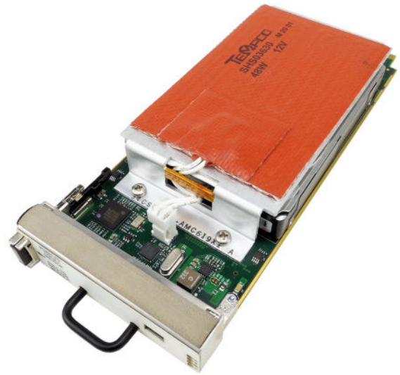
Figure 1: AMC619

The AMC619 is an AMC.2 Host Bus Adapter (HBA) which supports one SATA 2.5" disk as well as USB 2.0 to SDHC socket.