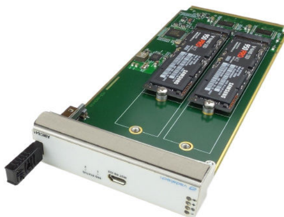
Figure 1: AMC641

The AMC641 is available in both air-cooled (MTCA.0 and MTCA.1) and rugged conduction-cooled versions (MTCA.2 or MTCA.3, contact sales for details).