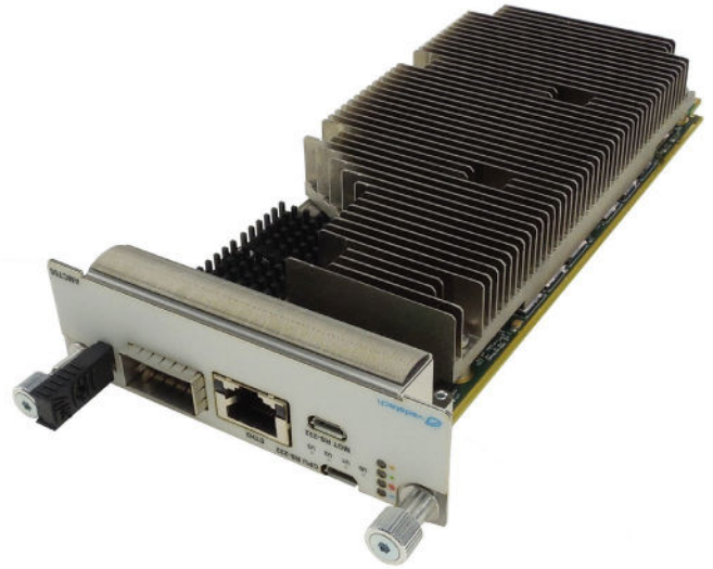
Figure 1: AMC705

Two 64-bit wide memory banks provide up to 16 GB of DDR4 with ECC.