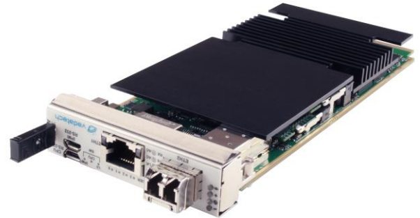
Figure 1: AMC713

The module is also available for rugged conduction-cooled applications (MTCA.2 or MTCA.3).