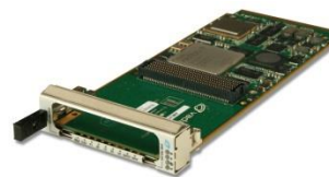
AMC517 Kintex-7 FPGA