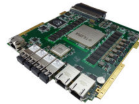
AMC740C Tiler GX72 Processor AMC