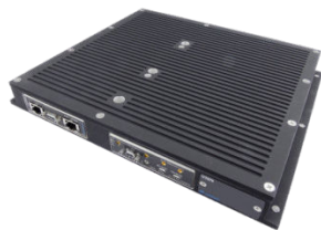
VT878 Compact Conduction Cooled MTCA Chassis, 2 AMCs