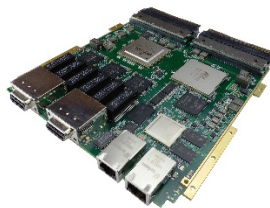
UTC040C Conduction Cooled MCH for uTCA Chassis (3rd generation)