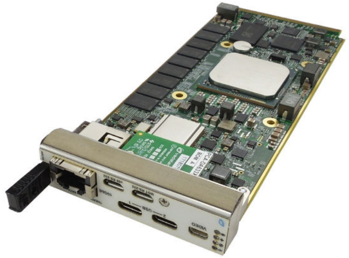
Figure 1: AMC752

Linux OS is standard on the AMC752, consult VadaTech for other options.