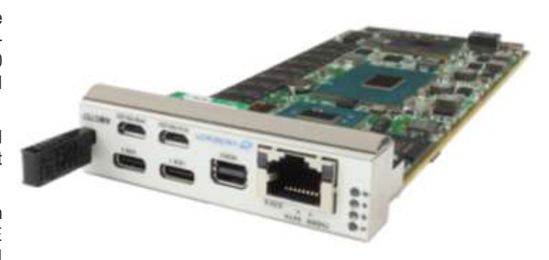
Figure 1: AMC757

Linux OS is standard on the AMC757, consult VadaTech for other options.