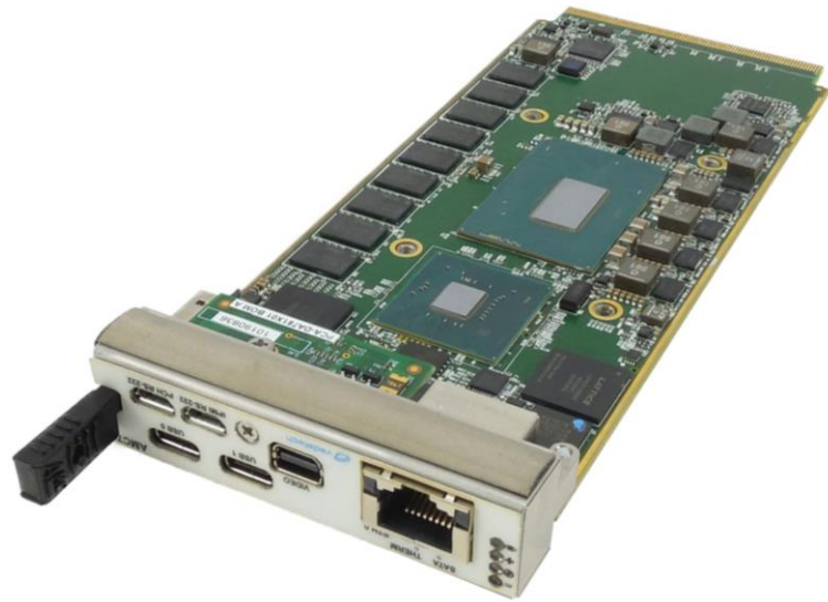
Figure 1: AMC760

Linux OS is standard on the AMC760, consult VadaTech for other options.